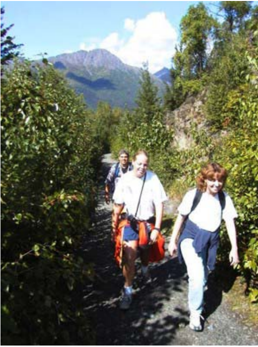
Man can live in harmony with nature with a little caution and a lot of respect. These hikers travel together for safety.

ancient human lifestyle, they were often appeased rather than hunted. The development of guns opened a second, bloody period in our relationship with predators, in which the goal was more often extermination than control . The old respect was tainted with—or replaced by—contempt. Predators were often seen as murderers of other animals, inherently fierce and bloodthirsty. Bounties were often placed on predators to encourage people to kill them for money. The third period was started not by a new invention but by a shift in attitudes, the belief that all forms of life have a right to exist and should be treated as fellow travelers rather than rivals. The attitude has not yet spread everywhere or equally affected our relationship with all species, but it is growing and having a significant impact on our culture.