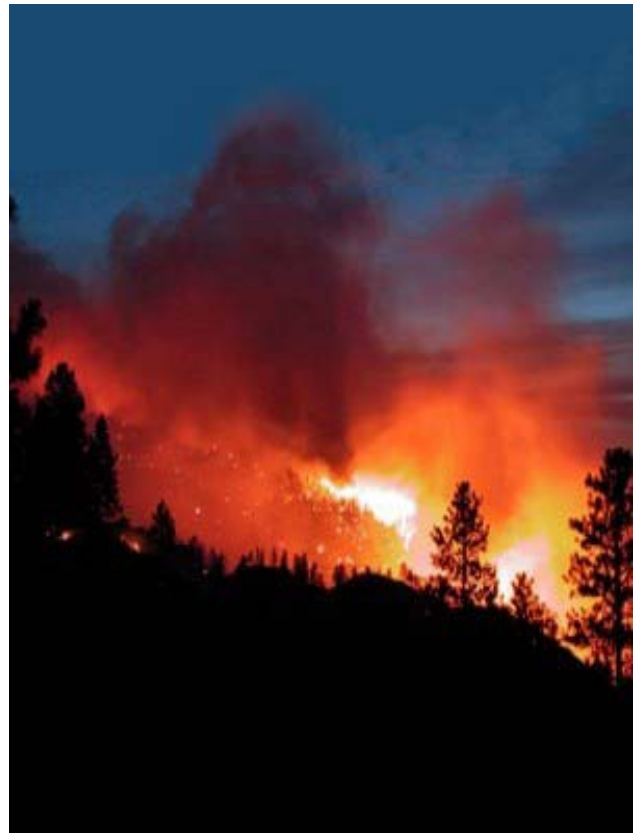
The bobcats, lynx and cougars that used to hunt here to support their families will have to go elsewhere. A moment of carelessness with a campfire can take years to repair. It is better to be careful now than sorry later.

If we learn to live within our means, we can provide a good living for mankind while preserving the wild places of the Earth for future generations. This may involve making some tough choices, but the end result is well worth the price. Some of the ways you can help preserve wild habitat might not be obvious. Using your community recycling programs reduces the need to obtain materials from the wild and reduces the burden at already-overcrowded landfills. Using caution with fire prevents the tragic loss of habitat and perhaps life. Proper disposal of litter, pesticides, batteries and used oil prevents contamination of the environment. Local “cleanup days” for rivers, creeks and parks can always use willing hands. You can even create instant habitat in your back yard for migratory birds by putting up bird feeders and bird houses. In return, you get to enjoy their colorful presence and possibly a drop in insect pests such as mosquitoes. Find out what other ways you may be able to help prevent habitat loss in your neighborhood. With a little help from anyone, the world can become a better place for everyone.