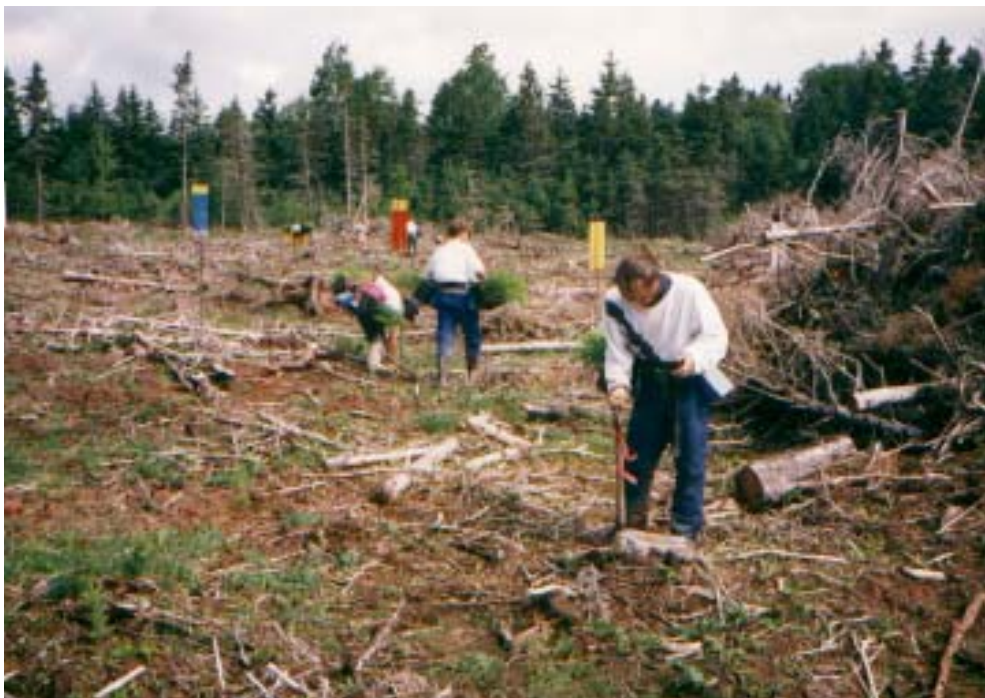
Land is being replanted with trees and will soon be a restored habitat for wildlife. Reclamation can't return an area to virgin wilderness, but it can turn barren land back into productive habitat. More enlightened forestry techniques emphasize the replanting of trees for “sustainable yield” so that the same area continues to produce new timber for man's use while providing food and cover for wildlife as it grows. This allows virgin wilderness to remain untouched for future generations to enjoy while providing the products man needs to construct a suitable human habitat.