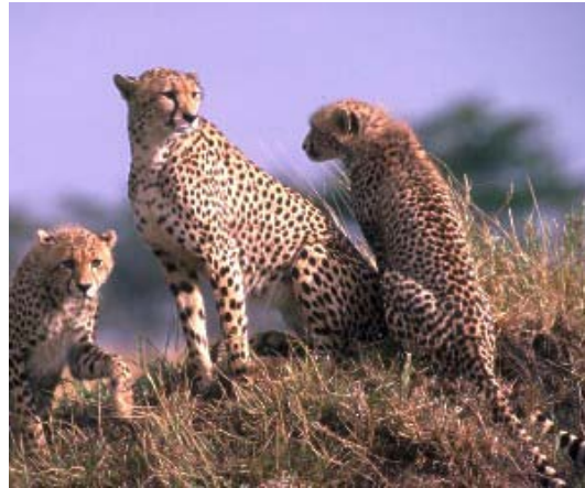
The cheetah is the poster child for poor genetic diversity. All cheetahs are very closely related.

Trait - The smallest difference in a living thing that can be inherited. Eye color is a trait, but height is a complex thing affected by several different traits and the living thing's environment.